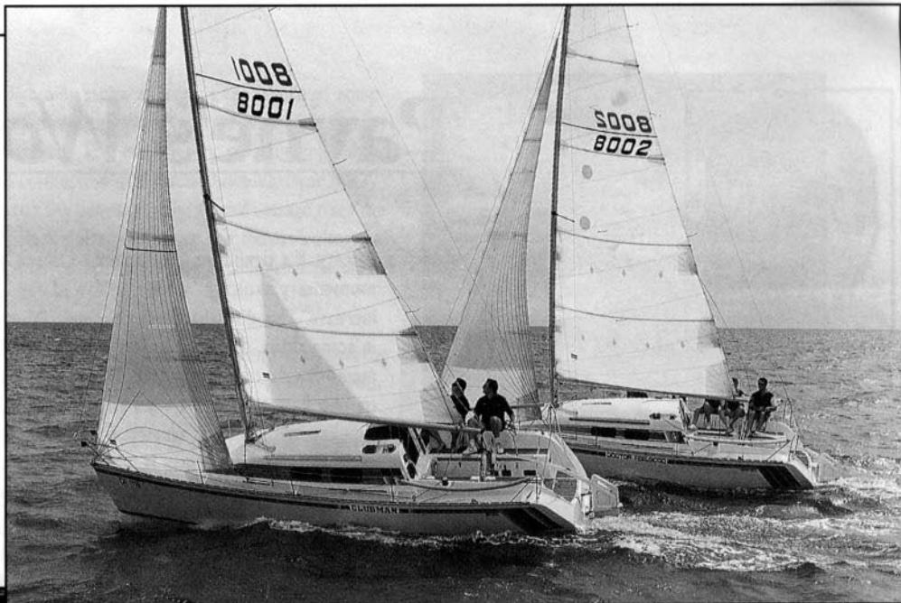
ABOVE: In 1994 the Clubman 8 won the Australian Boating Industry's "Yacht of the Year" Award. LEFT: The modern Austral craft have built up an admirable performance record. BELOW: The Austral range has acquitted itself well in rough conditions.